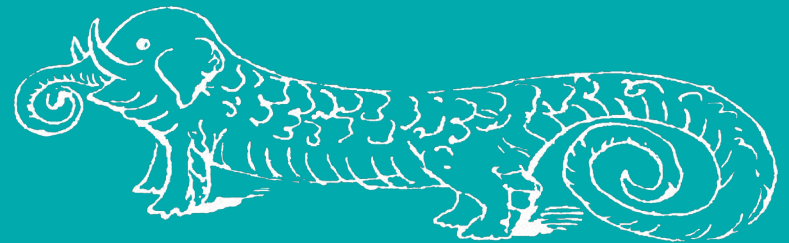
ABOVE: An 'Elegator' from C. T. Druery's April Fool's joke of 1883.