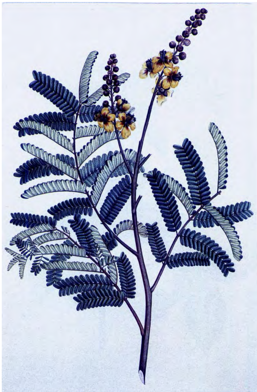
Plate 369 Peltophorum pterocarpum (de Candolle) Backer ex K. Heyne. Collected in Java, South of Anger Point. The plate maker is unknown.