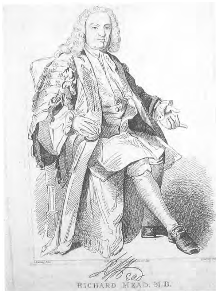
Figure 4. Sir Richard Mead. Etching by J. Romney after a portrait by A. Ramsay.

Hall, although this is not a 'Mead' vellum. In that painting, Ehret shows the plant dwarfed by a great Atlas moth, hovering over it. These huge insects can attain a wing-span of 12 inches. They come from India, where the Kaempferia is also native.