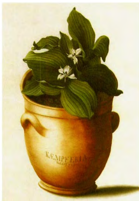
Figure 1. Kaempferia , by G.D. Ehret, 1740; body-colour on vellum.

Germany, earning a living as he went. In 1733, he met Christoph Jacob Trew (1695–1769), a physician and botanist of Nuremberg. Trew showed Ehret how to dissect flowers and taught him the importance, in botanical painting as opposed to flower painting, of including the details of the sexual parts (pistil, stamens, etc.). This feature distinguishes his work as foremost in the field of botanical art at that period. In 1736, Ehret published an engraving of a 'Tabella' showing Linneaus's system of plant classification based on these characteristics. Ehret's splendid and accurate paintings are still much admired, both for their beauty as well as for their botanical accuracy. He generally added the full name of the subject and signed and dated his work. For the rest of his life, he would send Trew paintings of unusual plants. Many of these were engraved to illustrate Trew's books, such as Plantae Selectae , 1750–1773, 10 dec., and Hortus Nitidissimus , 1758–1786, 3 vols.