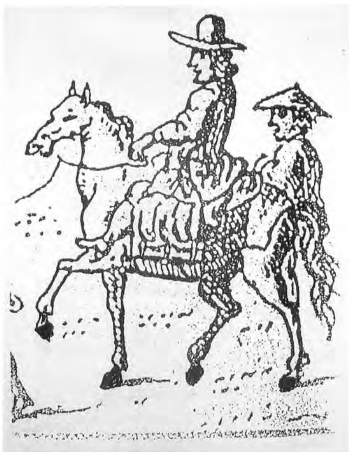
Figure 3. 'Keh-pe-ru' travelling with his servant in Japan, 1691; engraving after Kaempfer's sketch; The History of Japan , 1728, v2, p430, tXXII.

It is possible that the Linnean Society's Kaempferia is a 'Mead' vellum. In the catalogue, it is no. 104 but when the vellum was removed from the old frame, the number was not there. What was there, however, was a sentence in ink, which reads: "By Dr. Kempfer, it is [called (illeg.)] Wanbon". This is taken from the citation added to item 104 in the Mead list. After giving the name and reference, as they appear on the terracotta pot [see Fig.1], it states: