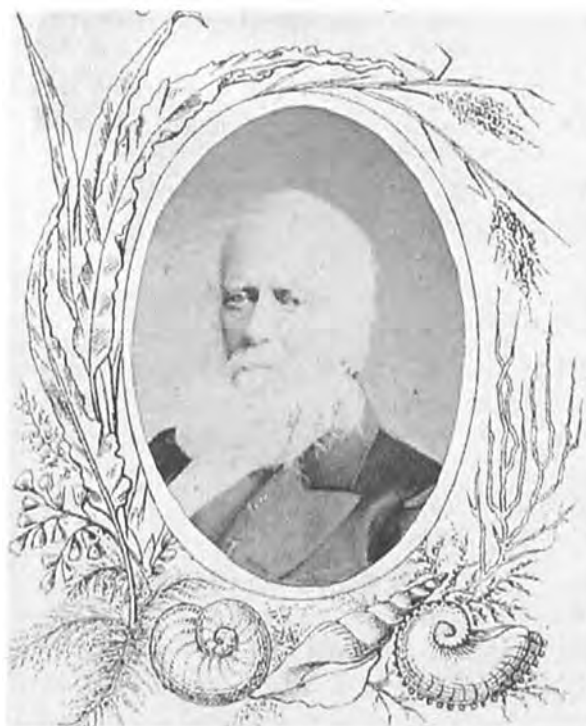
Clue: Like Linneaus he classified minerals as well as plants and animals.