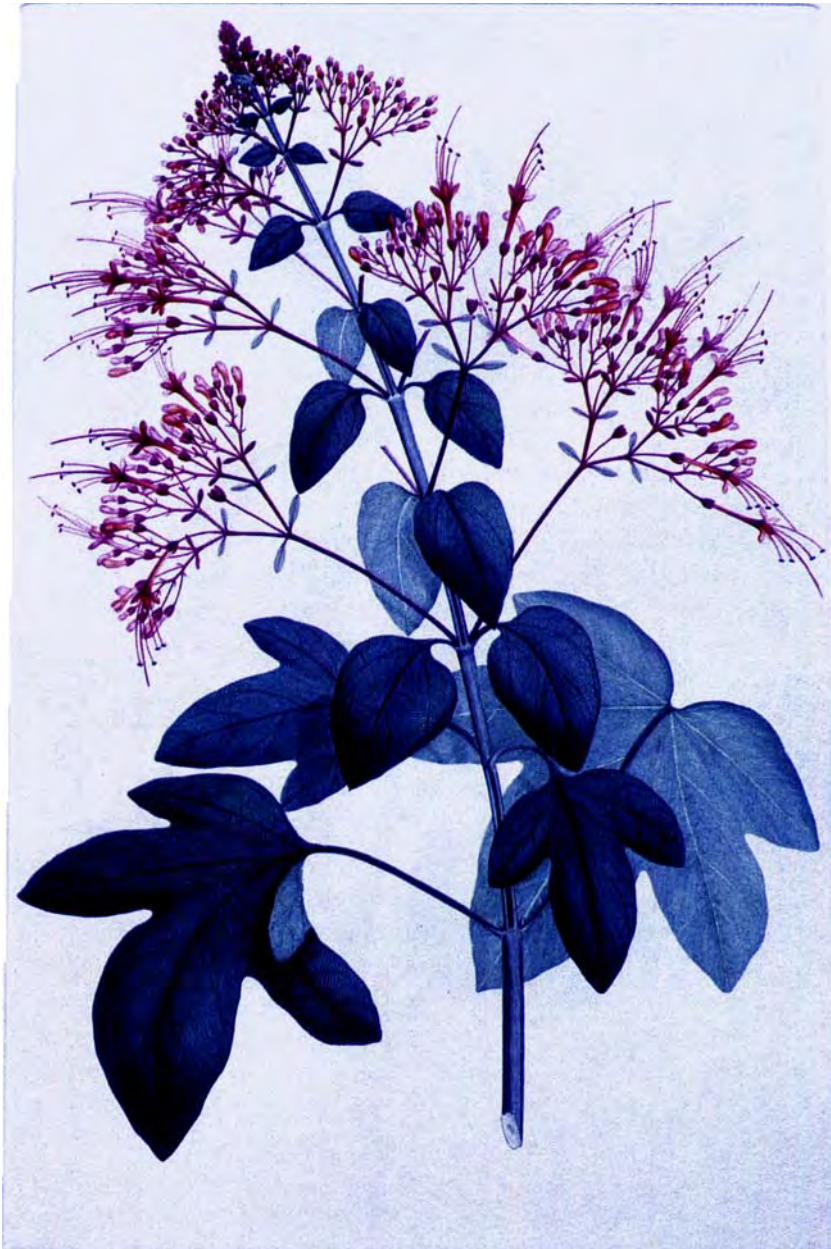
Two engravings from Banks Florilegium , based on the drawings of Sydney Parkinson made during Captain Cook's voyage, 1768–1771 and printed "à la poupee" for Alecto Historical Editions and The British Museum (Natural History) at the Edward Egerton-Williams Studio 1980–1989.

Plate 380 Clerodendrum paniculatum Linnaeus. Collected in 'Batavia'.