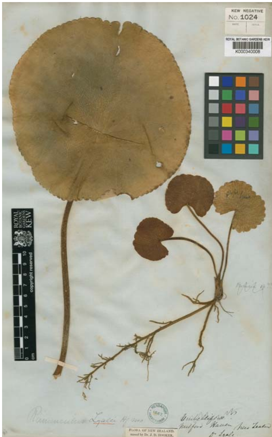
Figure 11. Ranunculus lyallii Hook. f., collected by David Lyall, Milford Sound, New Zealand, 1851.