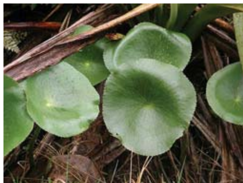
Figure 9 (right). Peltate leaves of Ranunculus lyallia , Arthur's Pass, New Zealand, 17 November 2006.