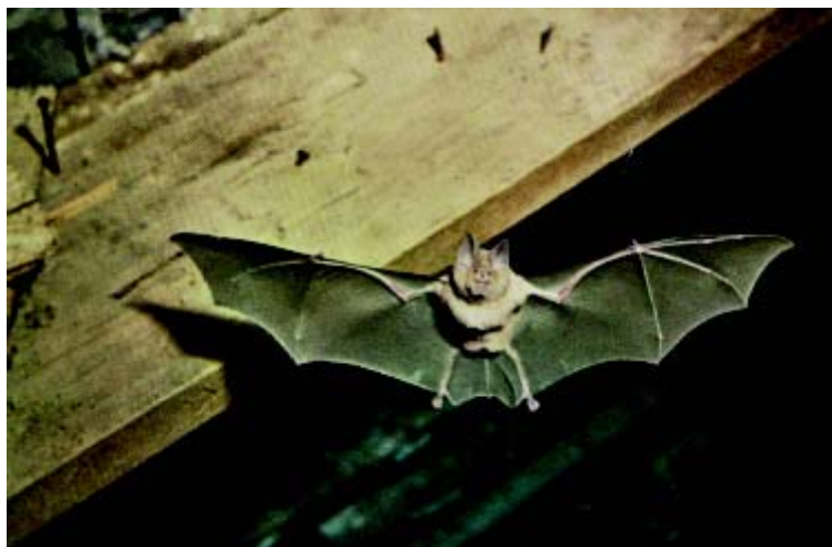
Probably the first successful colour image of a greater horseshoe bat in flight, c1970.

Their early notes suggest that survival and longevity were not a particular topic for investigation, however the prolonged study and thorough searches produced some impressive records. A greater horseshoe bat (no. 918), originally ringed at Buckfastleigh