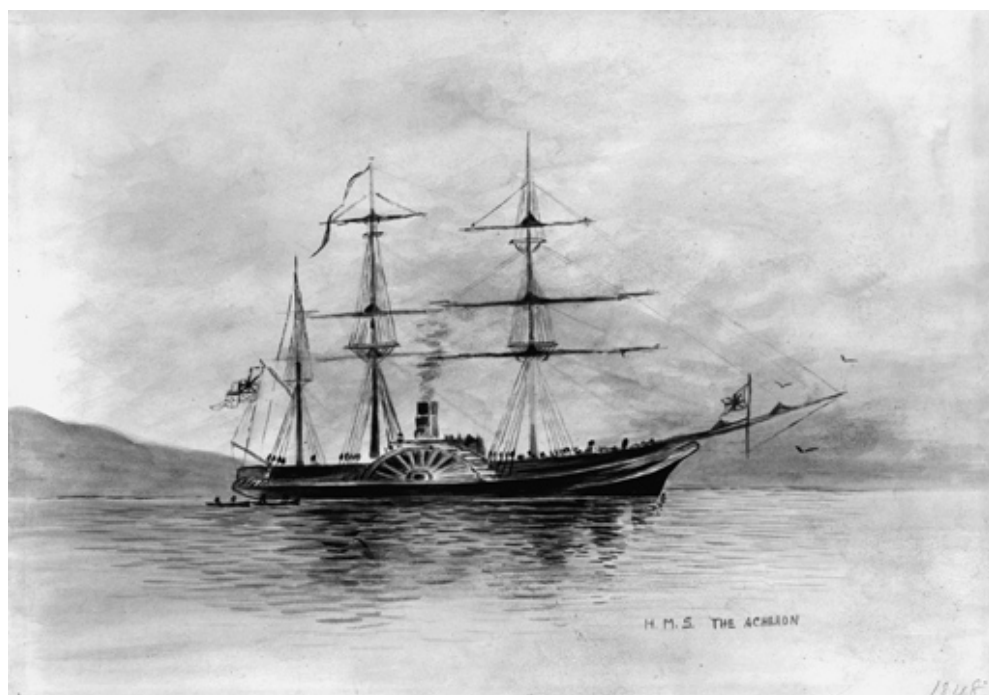
Figure 7. HMS Acheron . Unknown artist.

was not able to identify it at that time. Hooker, writing in 1886, described how it was identified: