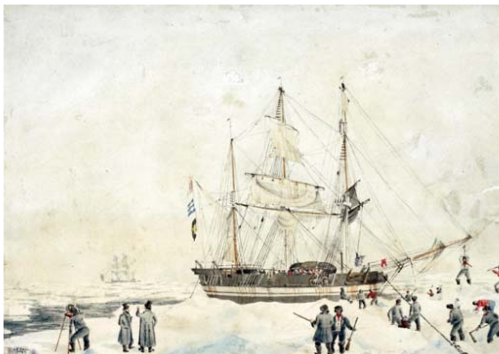
Figure 3. Watering in the Pack. Watercolour by J. E. Davis. © Scott Polar Research Institute, Cambridge.

remarkably, was erupting at the time, and Mount Terror. Other geographical features were named after other members of the expedition, in the Victorian manner, including Cape Hooker and the Lyall Islands ( 70^{\circ} 45' S , 167^{\circ} 20' E ; Ross, 1847: 364; Geographical Names of Antarctica p. 199).