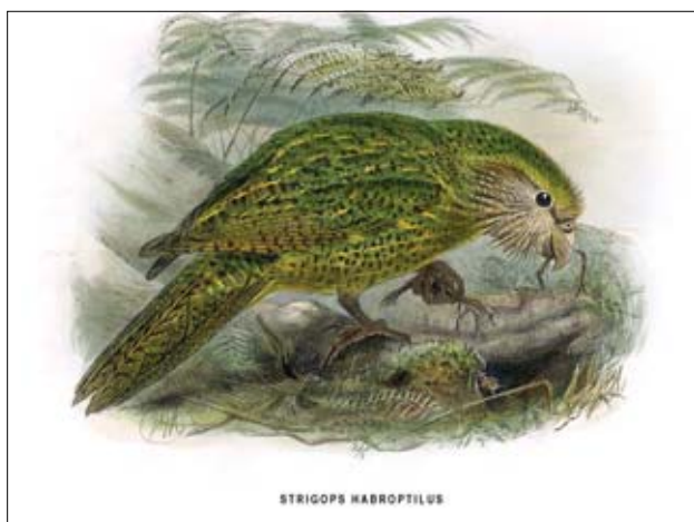
Figure 13. Print from Birds of New Zealand by Walter Lawry Buller, 1873.

being scarcely moved; and the bird alighted on a tree at a lower level than the place from whence it had come, but soon got higher up by climbing, using its tail to assist it.” (Lyll, 1852)