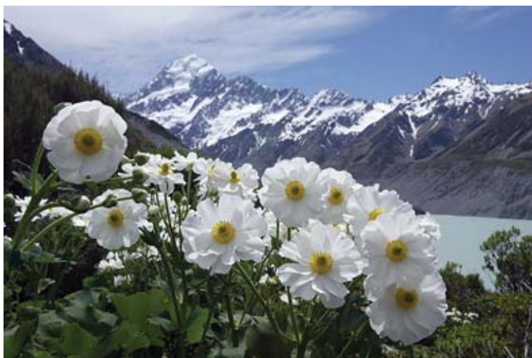
Figure 8 (above). Ranunculus lyallii . Hooker Valley, Mount Cook National Park, with Lake Tekapo.

“Hooker could never have tackled this first published account of the New Zealand flora without access to the specimens of more than thirty botanists and collectors. One notable collector, David Lyall the naturalist on an official survey of New Zealand in 1847, had been assistant surgeon on HMS Terror. Hooker dedicated this Flora to his former colleague and two other distinguished collectors – William Colenso 12 and Andrew Sinclair.” 13 (Desmond, 1999: 204)