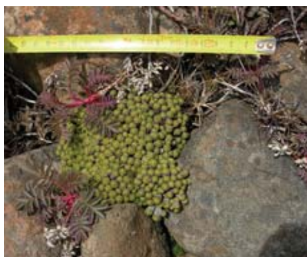
Figure 5. Lyallia kerguelensis . 2 January 2006, Île Australia, Îles Kerguelen.

Hooker wrote that David Lyall’s conduct on the expedition was reported to the Admiralty “as meriting the highest commendation” and “to him were due many of the botanical results of the expedition” (Hooker, 1844: 60, 1: xii). He added that “he formed a most important herbarium, amounting to no less than 1,500 species” and that “during the five winter months of 1842 in Berkeley Sound [East Falkland], made a beautiful collection of algae” which formed “an important addition to Antarctic botany” (Hooker, 1844: 60, 2: 215).