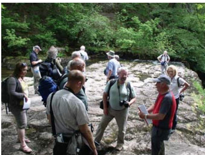
The group learning more geology above the Sgwd Clun Gwyn Waterfall.

A walk from the Mountain Centre above Libanus on the final morning afforded splendid views of Pen y Fan, the highest point in South Wales, and took in Traeth Mawr, a wetland once the site of a post glacial lake, and a Roman road.