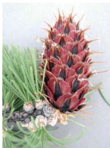
Figure 14 (left). Larix lyallii . North Cascades, Washington, USA. August, 2003. © Bud Kovalchik Photography. Figure 15 (right). Larix lyallii , cone. North Cascades, Washington, USA. © Bud Kovalchik Photography.

Royal Engineers, who mentioned in his report of 28 March 1860 that: