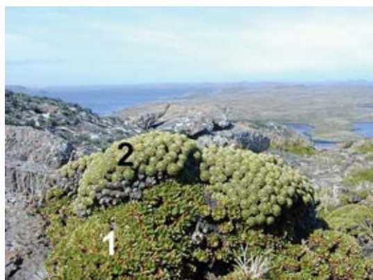
Figure 4. Lyallia kerguelensis , marked “2”, Kerguelen. Photograph, jardin. lautaret / Station Alpine Joseph Fourier.

The authors agree with Applequist et al. (Applequist, Warren, Zimmer, and Nepokroeff, 2006) that the genetic distance between Lyallia kerguelensis and Hectorella caespitosa justifies the maintenance of two genera, as do their different reproductive characters. L. kerguelensis is the only species of the genus.