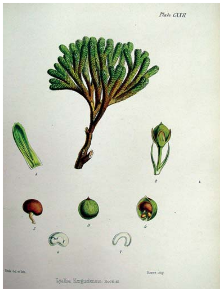
Figure 6. Lyallia kerguelensis , Plate CXXII in Hooker's Flora Antarctica (1844-60).

1, a leaf; 2, bractae, peduncle, and fruit; 3, utricle removed from the calyx; 4, vertical section of the same, showing the ripened and abortive seed; 5, seed and funiculus; 6, seed, with testa removed; 7, embryo (all magnified) (Hooker, 1844-60, pt. I, p.549).