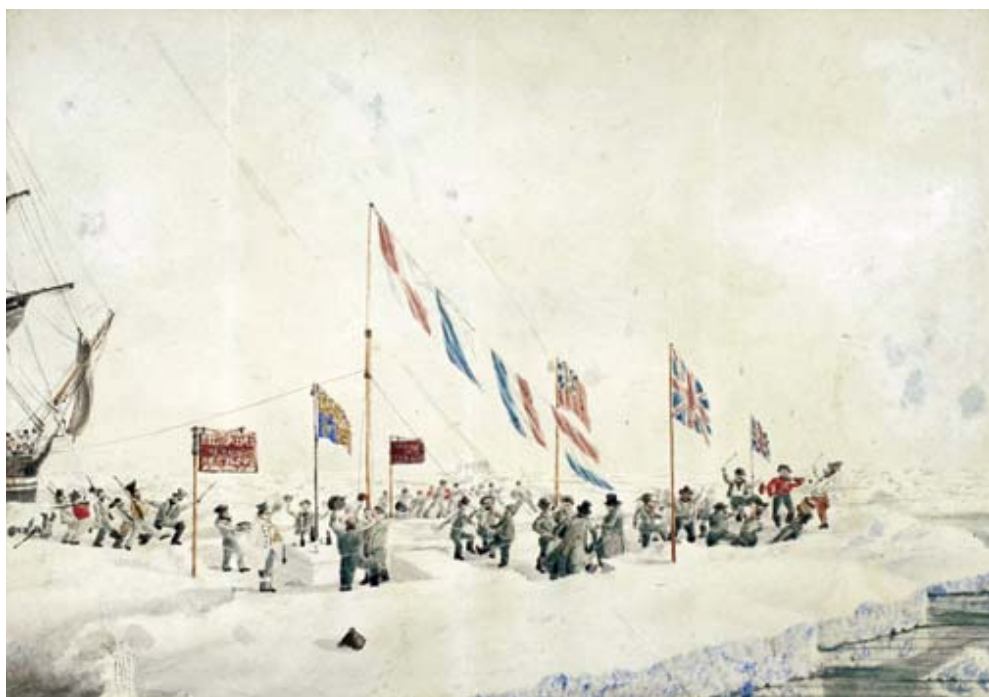
Figure 2. New Year’s Day, 1842, 66° 32′ S, 156° 28′ W. Watercolour by J. E. Davis.

The ships set sail from Chatham in the autumn of 1839 and took a year to sail via Madeira, the Cape of Good Hope and Kerguelen Island to Hobart, Tasmania. From Hobart they proceeded to the Auckland Islands, and Campbell Island. On New Year’s Day 1841 they crossed the Antarctic Circle for the first time. Three days later they encountered the pack ice. Ross had heard stories of a “lagoon” of open water beyond the ice in that area. When the ships reached the pack ice with the lagoon in the distance, Ross manoeuvred the ships repeatedly to strike the ice at the same point. This was in itself a remarkable feat of seamanship, given that the ships were powered only by sail. After a week of attempts, the ice broke and they sailed through into the lagoon, where no humans had ever been before. At the far end was the ice barrier itself. Ross estimated it at 180 to 200 feet high and it disappeared over the horizon in both directions. The ships sailed along it for some 300 miles. Ross discovered Victoria Land, McMurdo Sound, and two volcanoes, which he named after the ships: Mount Erebus, which,