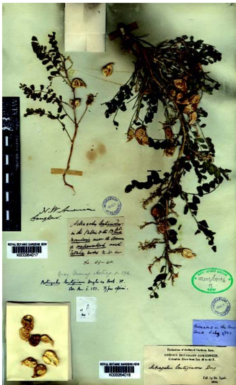
Figure 16. Astragalus lentiginosus var. lentiginosus . Collected by David Lyall. Oregon Boundary Commission, July, 1860.

In November Lyall was granted a further six months leave to complete the project. Sir Joseph Hooker commented that the publication: