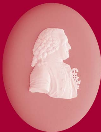
Carl Linnaeus 1707–1778

NEWSLETTER AND PROCEEDINGS OF THE LINNEAN SOCIETY OF LONDON