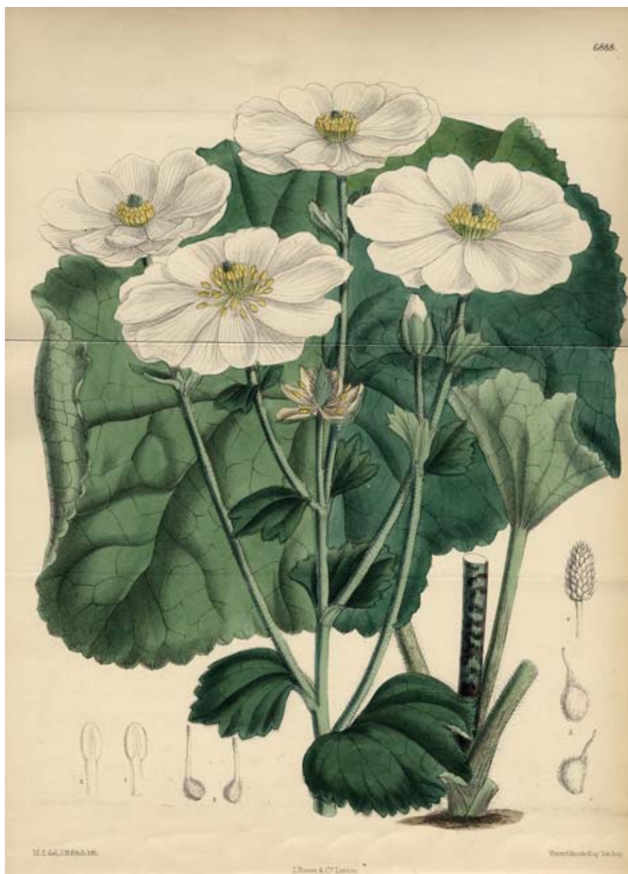
Figure 12. Tab. 6888. Ranunculus Lyalli . Curtis's Botanical Magazine , Vol. 112, 1886. Drawn by Matilda Smith and lithographed by J. N. Fitch.

The parrot is unique in being the heaviest of the parrots, being nocturnal or semi-nocturnal and for being flightless, or virtually so. Interestingly, David Lyall did observe the bird making a brief glide: