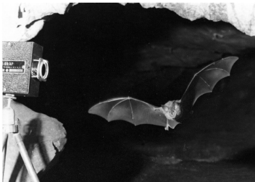
Hooper's light beam trigger allows a greater horseshoe bat to photograph itself by breaking the light beam. A Cadmium sulphide sensor is inside the box.

not available at that time. The meticulous data (date, site, location within site, species, sex, age, measurements, remarks) were transcribed from muddy notebooks used in the caves to 10 hard-backed ledgers listing the bat rings used and all the recaptures. There were also two loose-leaf folders that documented every site (by grid reference and name), every visit made to it, and the bats recorded there on each occasion. The earliest entry in the ringing logs is for December 1947, and the latest in the site records is February 2002. A dozen or more publications clearly chart the process by which John and Win started bat ringing, their hopes when they began, their progress towards better understanding of bat ecology, and, significantly, their deliberate decision to stop ringing when most of their objectives had been fulfilled. The records are exemplary, perhaps reflecting John's professionalism as an industrial chemist. The data are so voluminous and so complete that they offer opportunities for fresh analysis using previously unavailable statistical methods developed for use in bird ringing studies. This may throw fresh light on survival rates of ringed bats for example, also the population size at different dates.